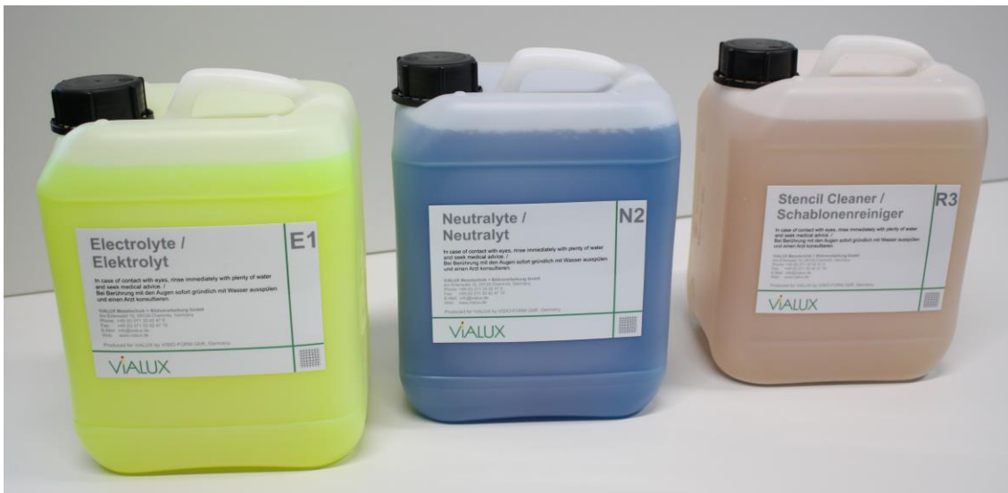
Grid marking equipment: E1 Electrolyte, N2 Neutralyte, R3 Stencil-cleaner

E1 Electrolyte is suited for the electro-chemical marking of a number of ferrous and non-ferrous materials. N2 Neutralyte, R3 Stencil-cleaner, and the coating of the stencil grids are harmonized to the E1 Electrolyte. In addition, ViALUX also supplies the electrical equipment that is necessary for marking.