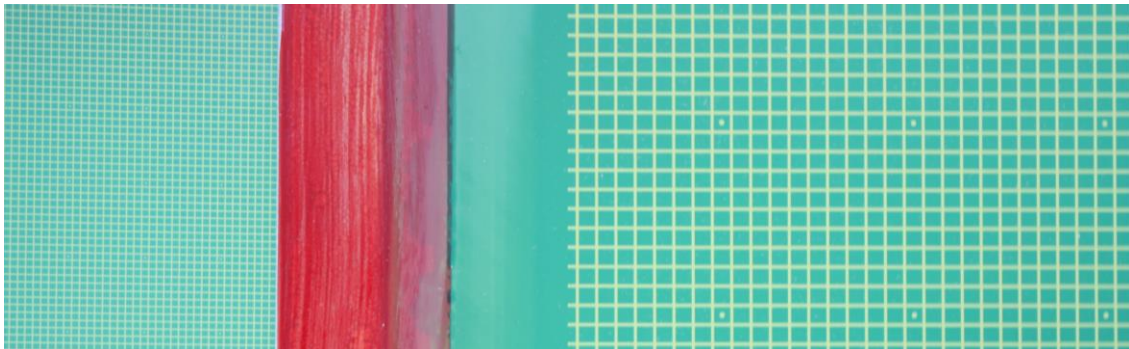
left: 1.0 mm Grid / right: 2.5 mm Grid

The grid stencils are fixed in a special stretching frame made of aluminium to obtain highest precision in marking (< 0.01 mm tolerance of grid points). There are standard grid stencils with 1.0, 1.5, 2.0, and 2.5 mm spacing, respectively. The customer can choose the best suited spacing for the forming process under investigation. Other spacings are available on request. The grids are well optimized and enable fully automated evaluation of the forming state in many applications.